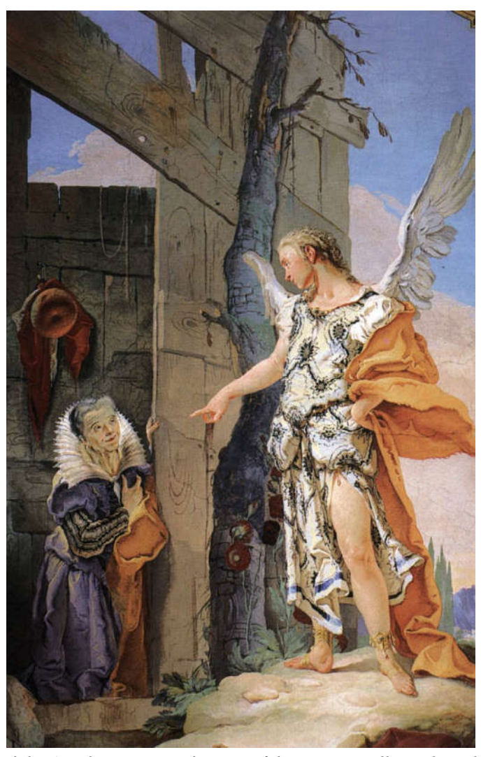
'Sarah and the Angel', represented in one of the narrow wall panels in the Gallery