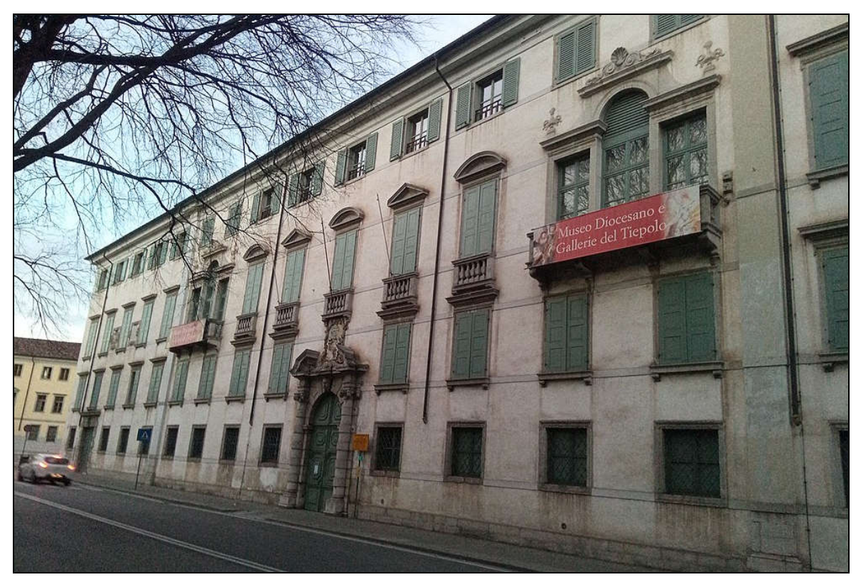
The Archiepiscopal Palace at Udine