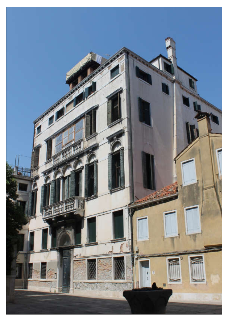
Palazzo Sandi-Porto, home to Tiepolo's first fresco in Venice