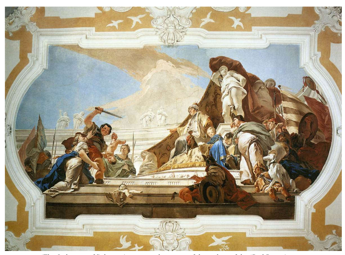
{\it `The Judgment of Solomon' occupies the centre of the ceiling of the `Red Room'.}