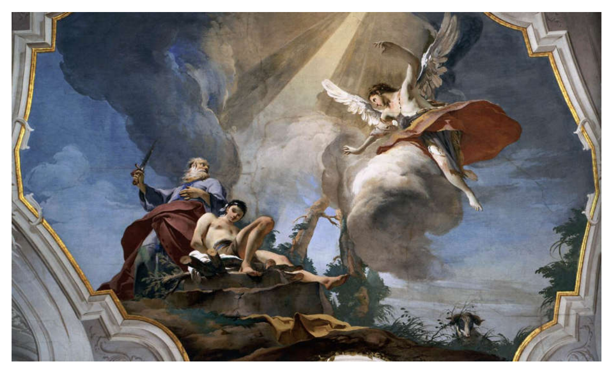
'The Sacrifice of Isaac', the central ceiling painting in the Gallery