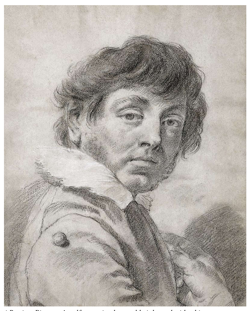
Giovanni Battista Piazzetta's self portrait, charcoal heightened with white on green-grey paper, Thyssen-Bornemisza Museum, Madrid, c. 1730