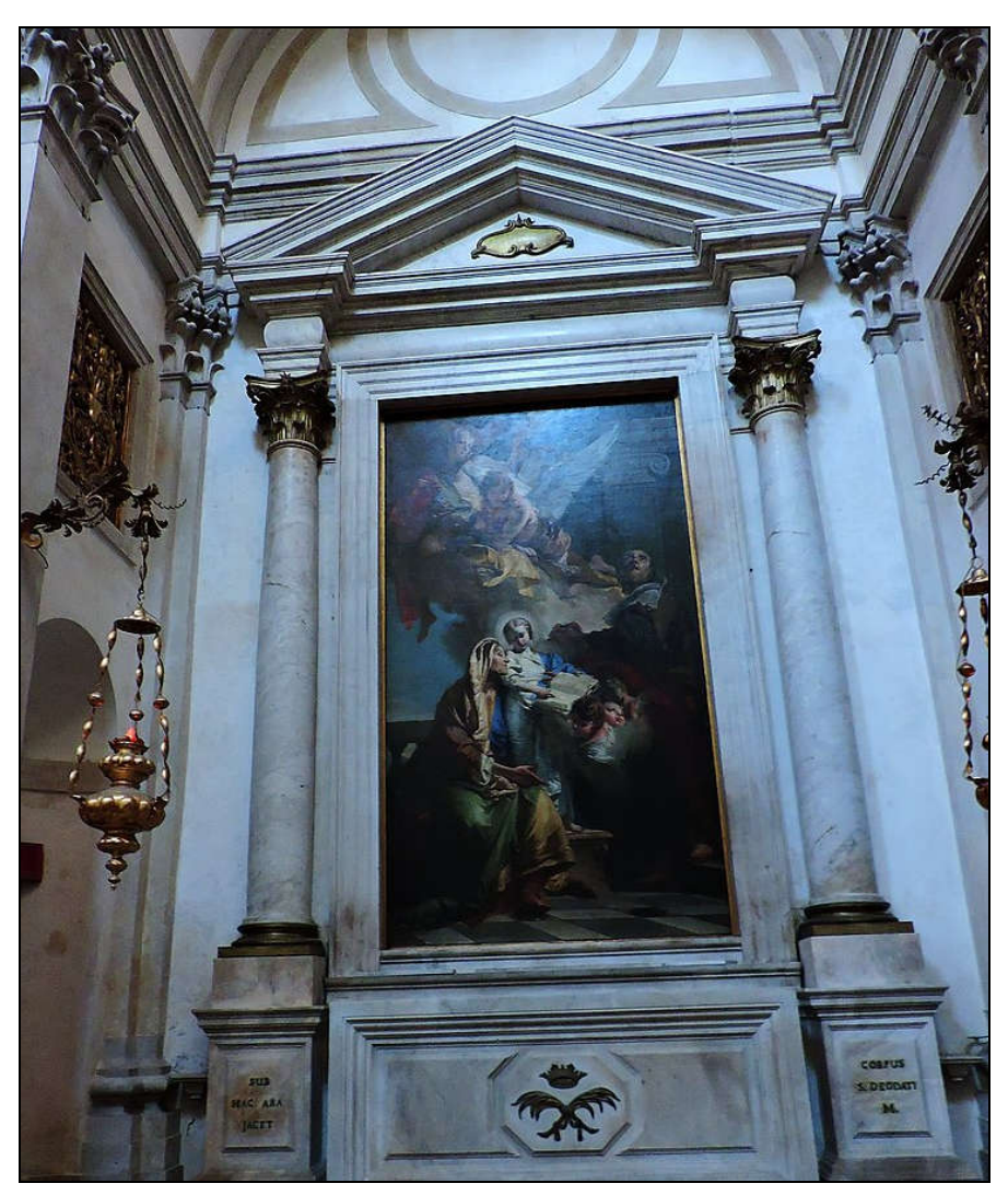
The altarpiece in situ