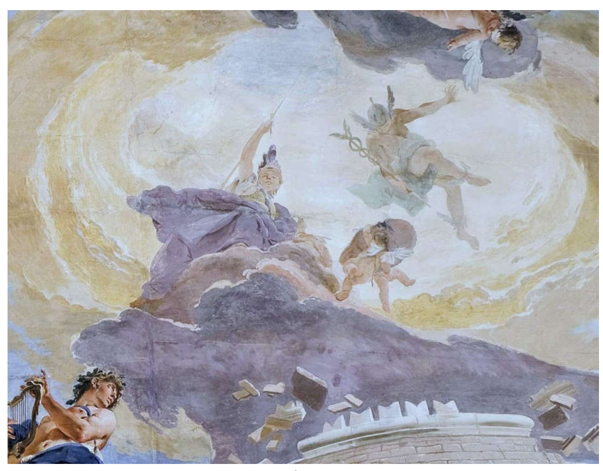
Minerva and Mercury