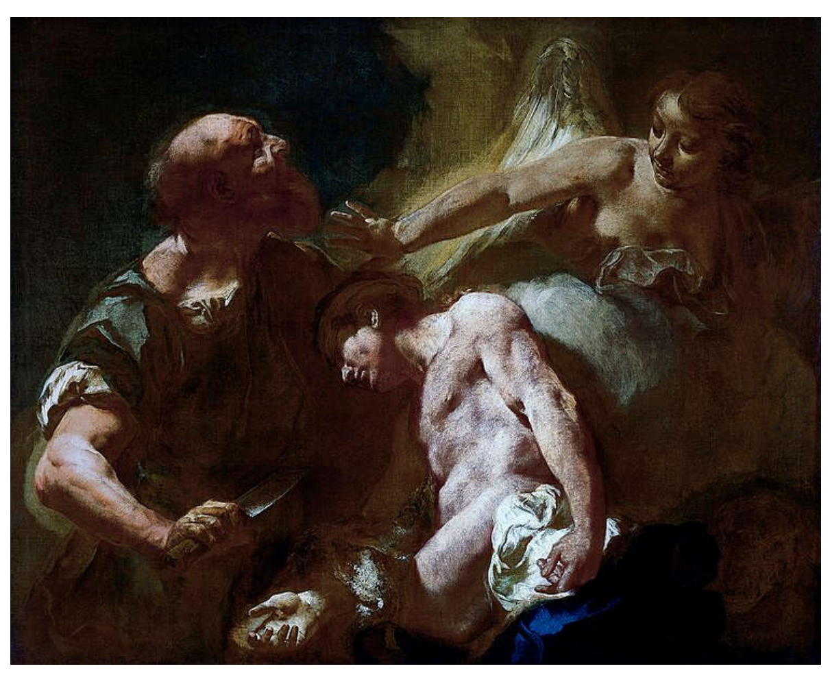
A likely source of inspiration: 'The Sacrifice of Isaac' by Giovanni Battista Piazzetta, Thyssen-Bornemisza Collection Foundation, Barcelona, c. 1715