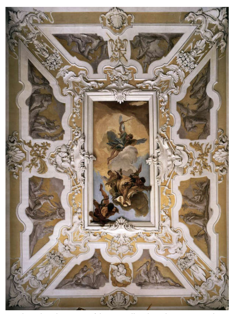
The ceiling decoration of the stairwell in the Palazzo Patriarcale