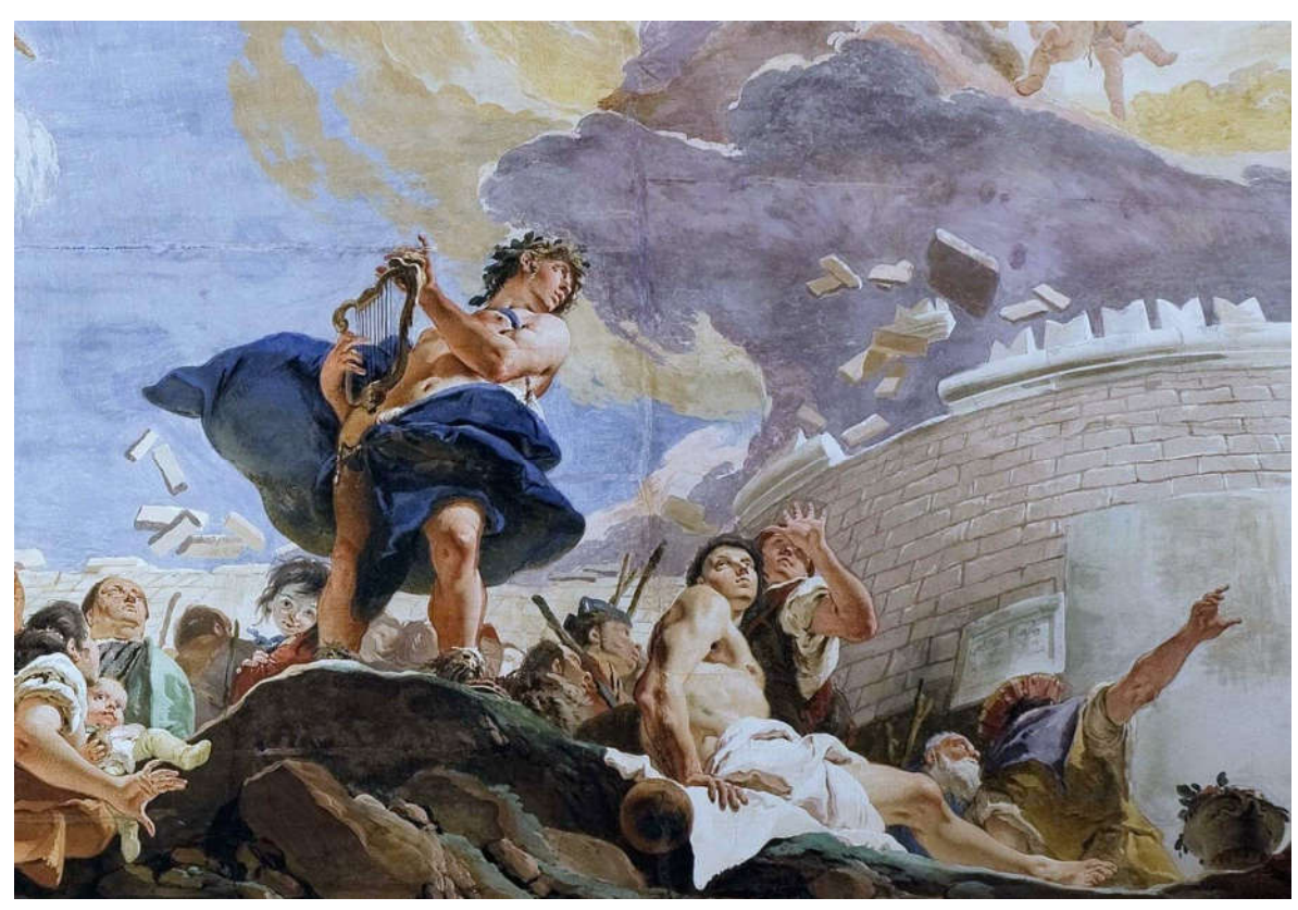
Amphion builds the walls of Thebes