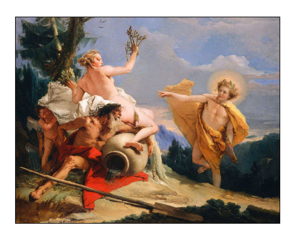
By Delphi Classics, 2023