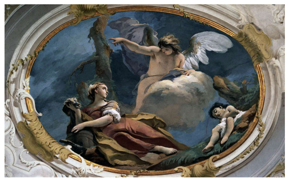
'Hagar and Ishmael in the Wilderness' one of the two outer scenes on the ceiling of the Gallery