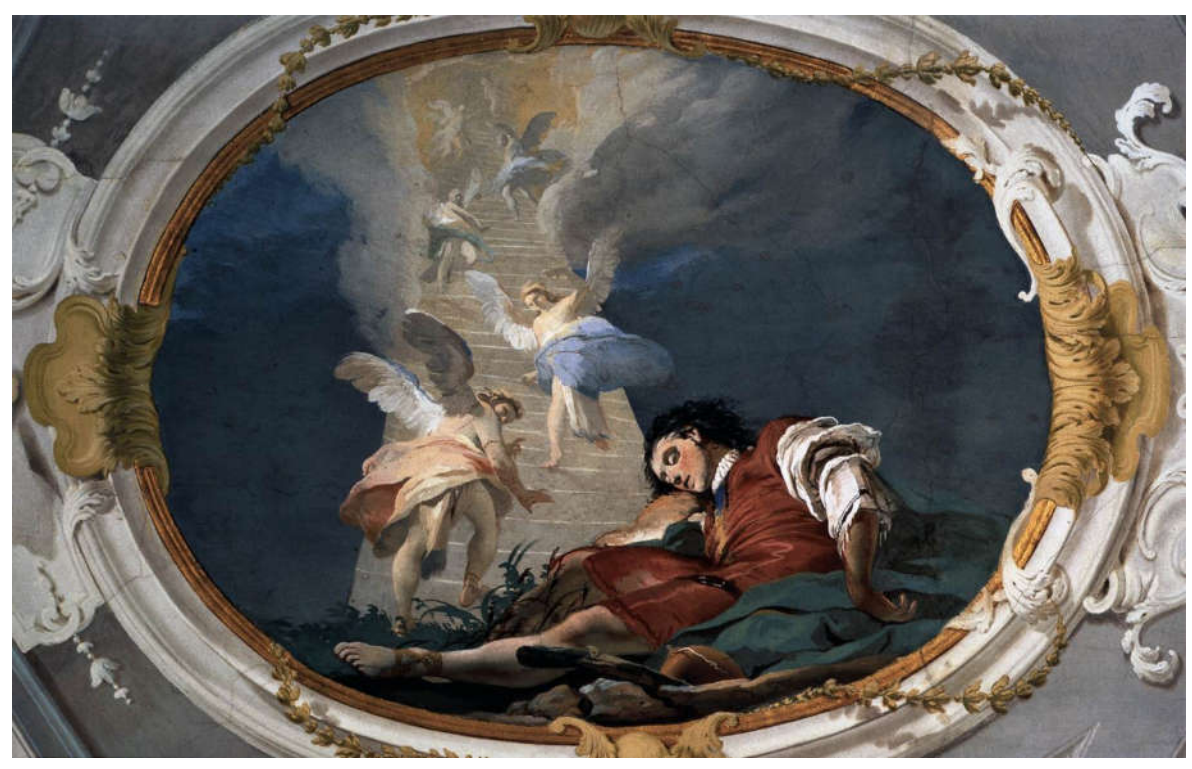
\hbox{\it `Jacob's Dream' the other outer scene on the ceiling of the Gallery}