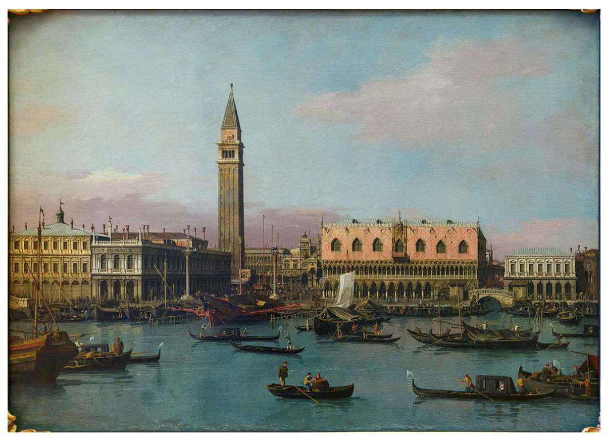
Venice in the eighteenth century by Canaletto, c. 1740