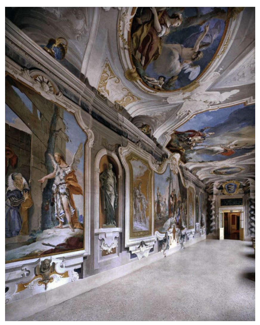
View of the Gallery