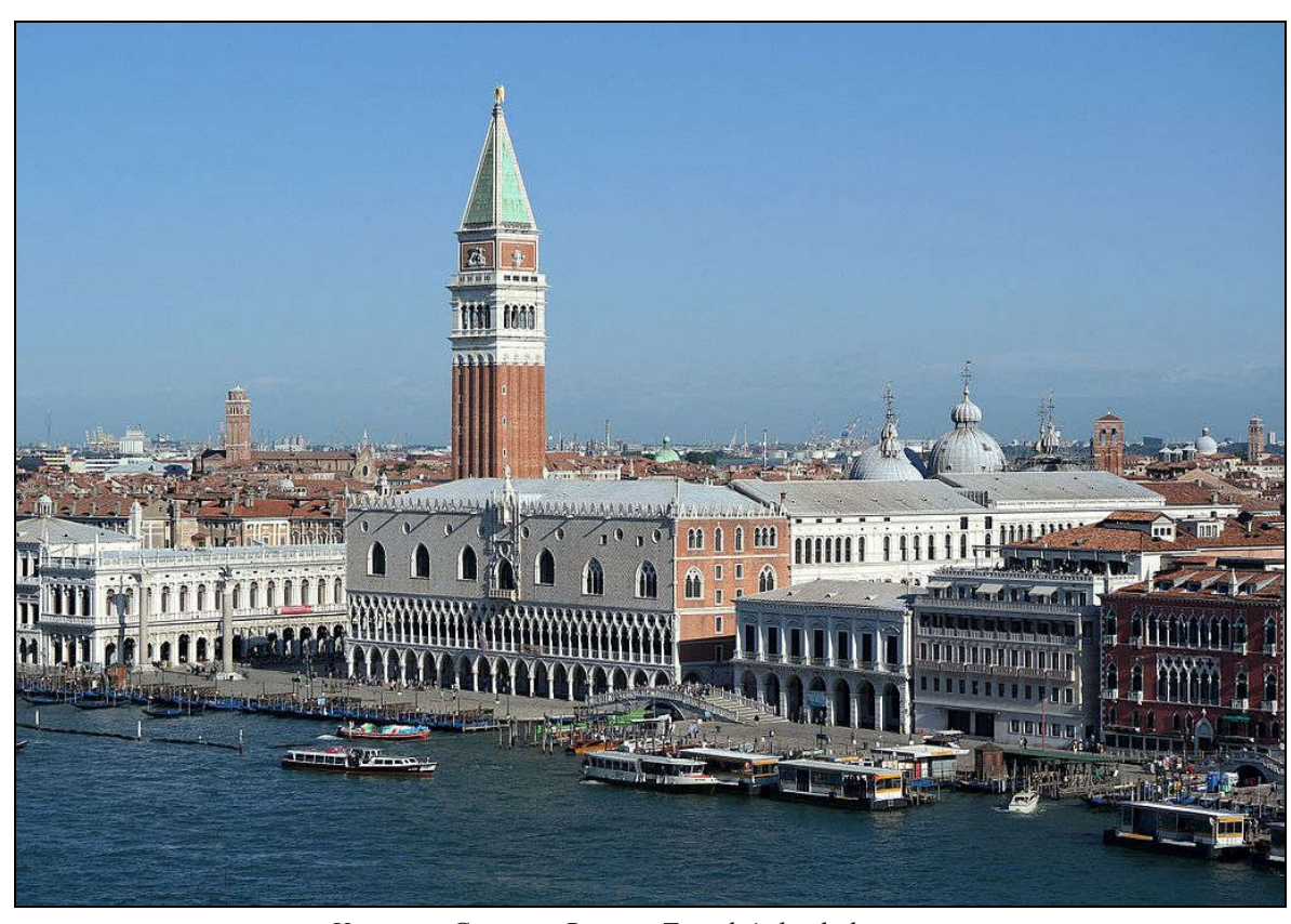
Venice — Giovanni Battista Tiepolo's birthplace