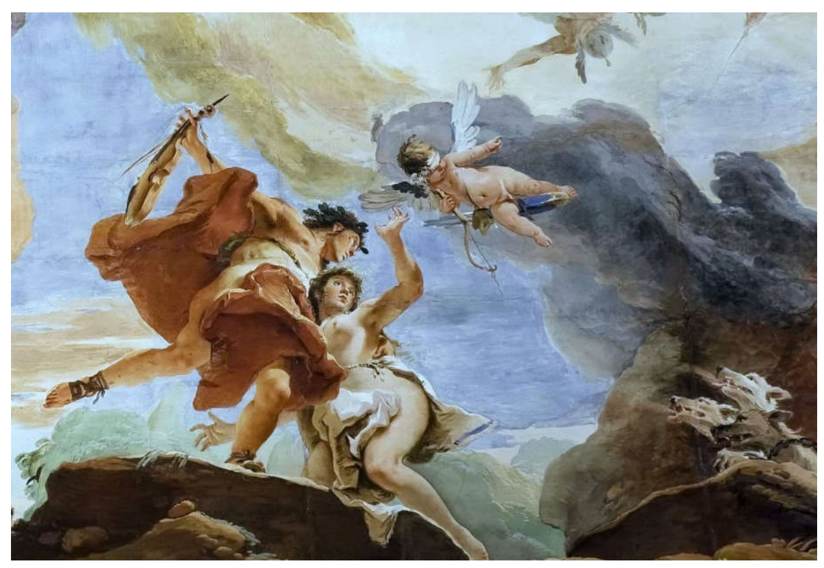
Orpheus and Eurydice