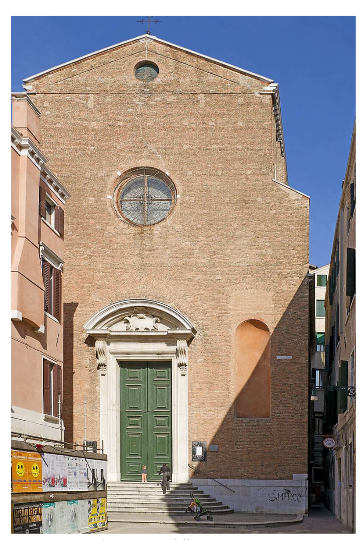
Santa Maria della Fava, Venice