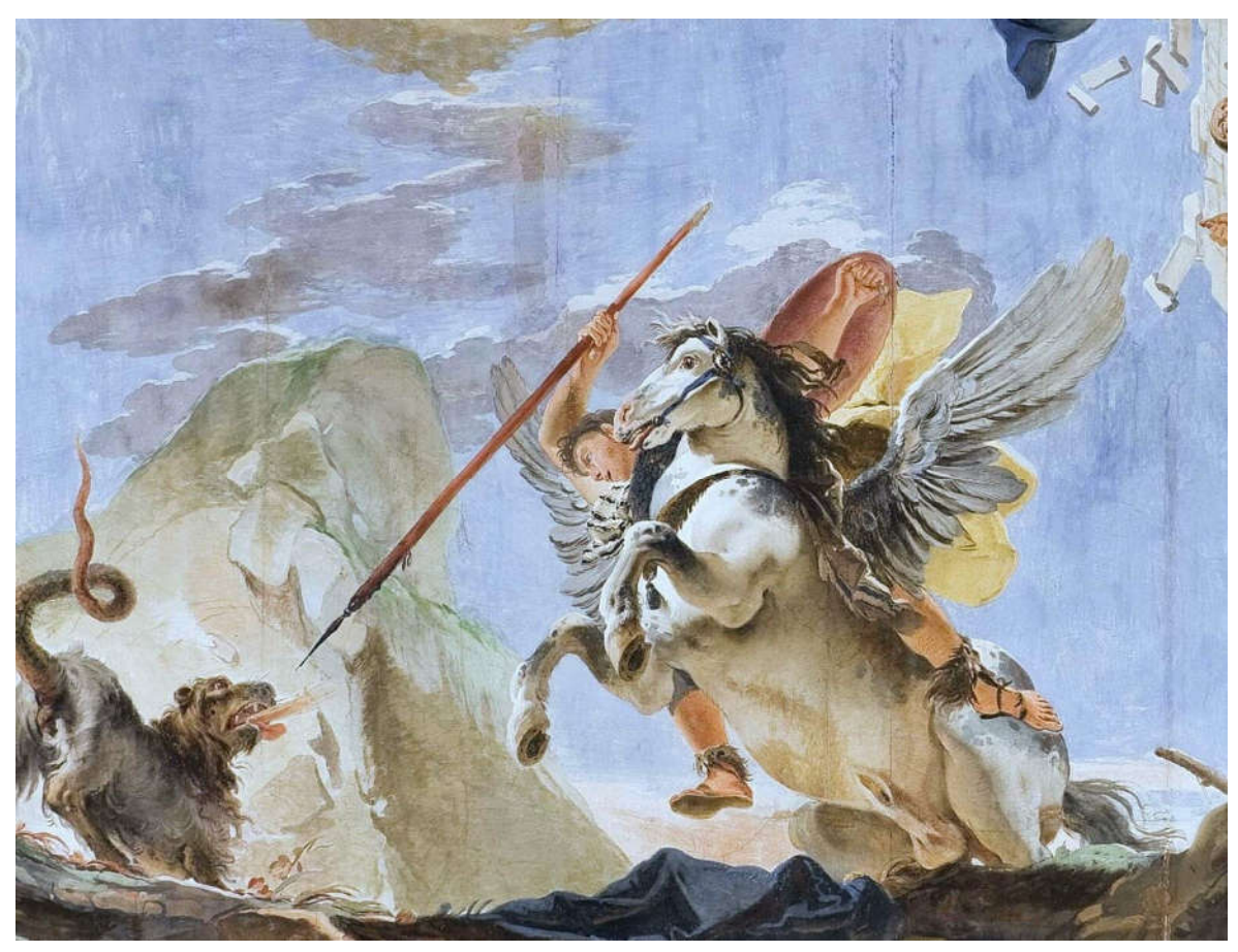
Bellerophon rides winged Pegasus, fighting the Chimaera