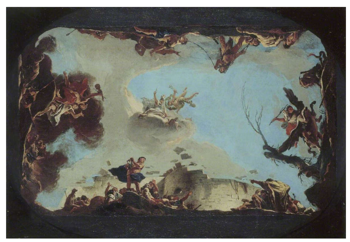
Tiepolo's oil sketch for the fresco, The Courtauld, London, c. 1725